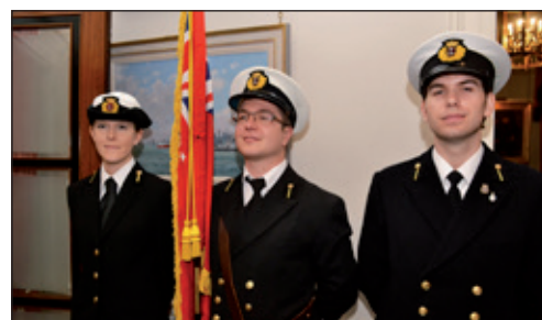
Warsash Maritime Academy cadets at the Merchant Navy Medal Ceremony