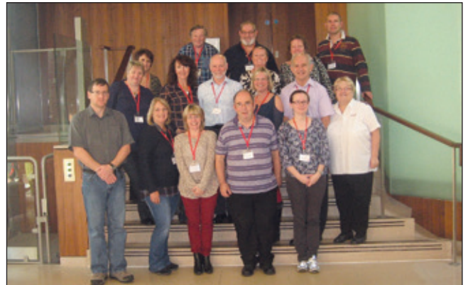
Delegates on the pilot Mental Health Awareness Course at the Salvation Army's William Booth College in London