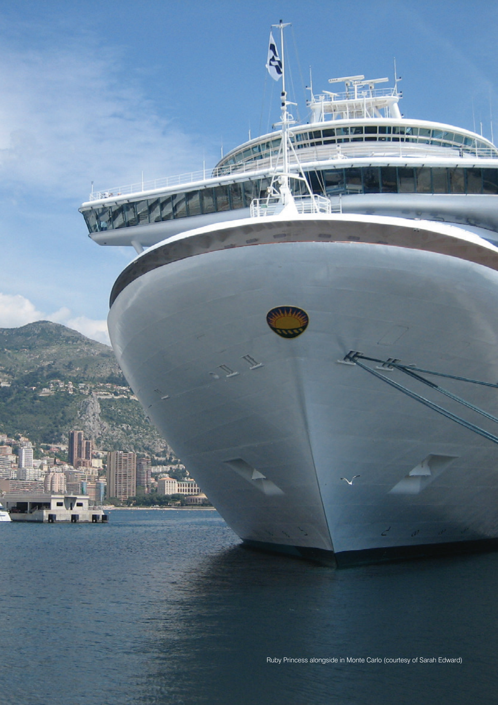
Ruby Princess alongside in Monte Carlo