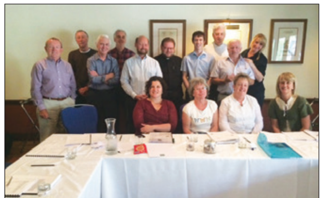
Delegates on the Ship Welfare Visitor Course in Bristol