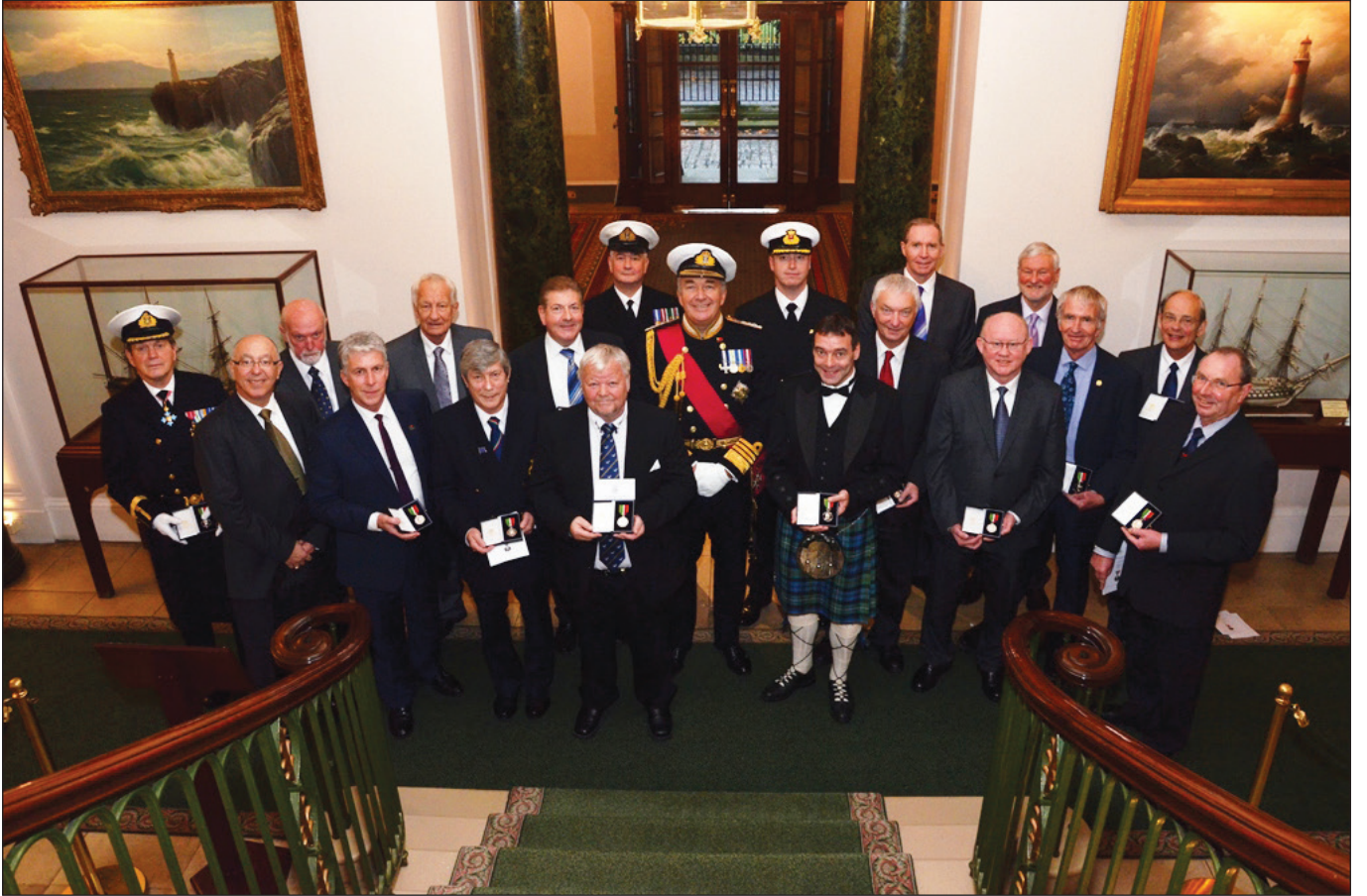
2014 Merchant Navy Medal Recipients at Trinity House, London