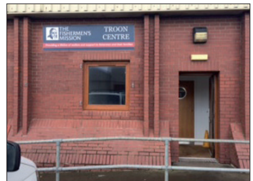
Newly refurbished Troon mini centre