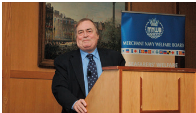
Lord Prescott, Patron of the MNWB addresses delegates at the conference