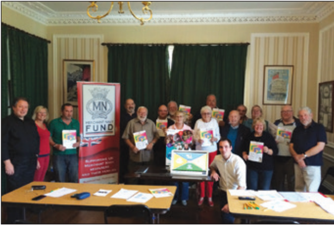
Care Ashore residents participating in the Digital Inclusion Project