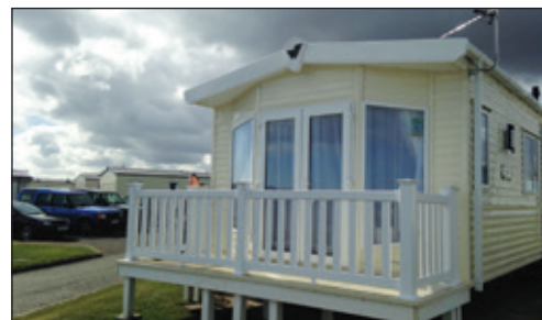
New Sailors' Children's Society family holiday home in Berwick upon Tweed